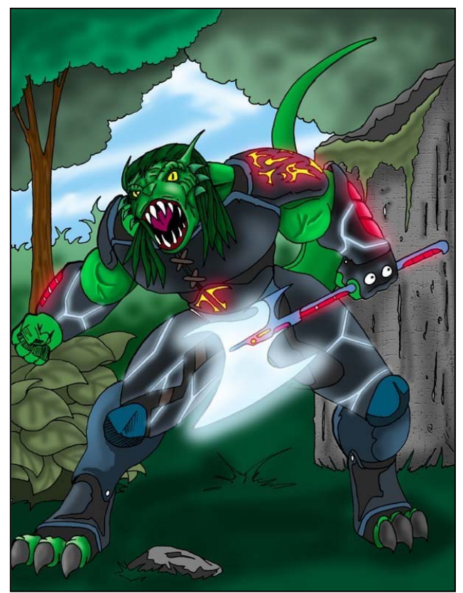
from father to eldest child. The Emperor is the universal warlord/priest and has absolute rule over all of the Dracos.

Government: The social structure of their society is a monarchy that rules over numerous powerful family/tribes. Succession occurs by physically besting the Emperor, or if never beaten